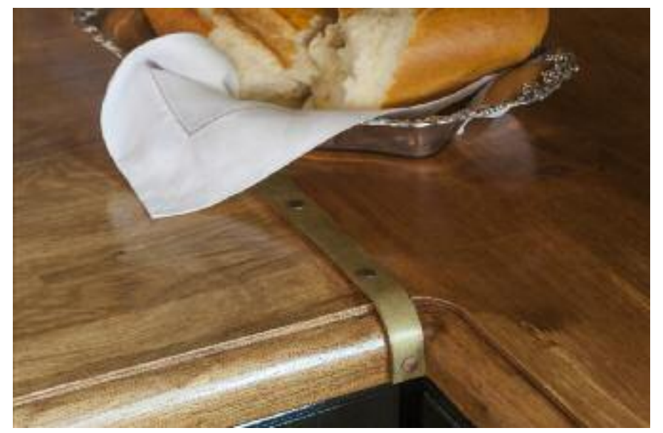
Do your countertops need refinishing? I have brass straps on butcher block and call in marine-grade finishers to keep them in ship shape.

Third: Take Photos, Look Objectively, Document Progress for Encouragement. We tell our clients to take photos of each room in their home this time of year. Why? Because you'll see the space more clearly once you take a solid photo of a space, let it alone for a few days, clear your head, and by extension, your visual palate and come back to the photos a day or two later.